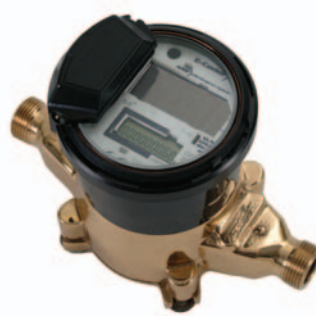
PIT SET VERSION

The E-Coder (ARB VII) is Neptune's next generation high-resolution solid state absolute encoder register. The E-Coder features a custom integrated circuit design that digitally encodes the rotation of the measuring chamber providing "absolute" registration with no internal battery requirement. The E-Coder functions in two modes: E-Coder BASIC and E-Coder PLUS. The E-Coder BASIC mode functionality is the same as ProRead (ARB VI) featuring programmability up to a 10-digit ID number, 3 user characters, and 3-6 digit meter reading. In addition to the meter reading, E-Coder provides a visual readout on rate of flow every six seconds when the LCD display is activated. When connected to Neptune's R900* radio MIU, the E-Coder automatically operates in E-Coder PLUS mode, providing a high resolution, 8-digit remote meter reading, and value-added features including leak detection, tamper detection, and reverse flow detection. True point-of-use leak detection is provided by monitoring a 24-hour period in fifteen-minute intervals. Tamper detection is provided by reverse flow detection and the number of days of zero flow over the previous 35 days.