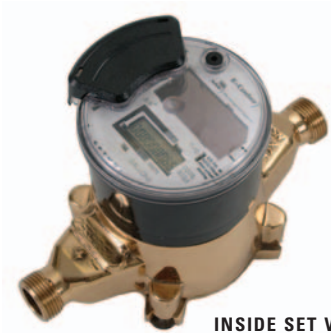
INSIDE SET VERSION

The E-Coder (ARB VII) is Neptune's next generation high-resolution solid state absolute encoder register. The E-Coder features a custom integrated circuit design that digitally encodes the rotation of the measuring chamber providing "absolute" registration with no internal battery requirement. The E-Coder functions in two modes: E-Coder BASIC and E-Coder PLUS. The E-Coder BASIC mode functionality is the same as ProRead (ARB VI) featuring programmability up to a 10-digit ID number, 3 user characters, and 3-6 digit meter reading. In addition to the meter reading, E-Coder provides a visual readout on rate of flow every six seconds when the LCD display is activated. When connected to Neptune's R900* radio MIU, the E-Coder automatically operates in E-Coder PLUS mode, providing a high resolution, 8-digit remote meter reading, and value-added features including leak detection, tamper detection, and reverse flow detection. True point-of-use leak detection is provided by monitoring a 24-hour period in fifteen-minute intervals. Tamper detection is provided by reverse flow detection and the number of days of zero flow over the previous 35 days.