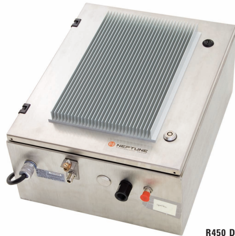
R450 Data Collector

Neptune's ARB® FixedBase System is an advanced, highly robust, two-way fixed base meter reading solution that delivers comprehensive usage information through a secure, long-range wireless network. ARB FixedBase provides the timely, high-resolution meter reading that enables water utilities to eliminate on-site visits and estimated reads, reduce theft and loss, implement time-of-use billing, and profit from all of the financial and operational benefits of fixed base automated reading and billing.