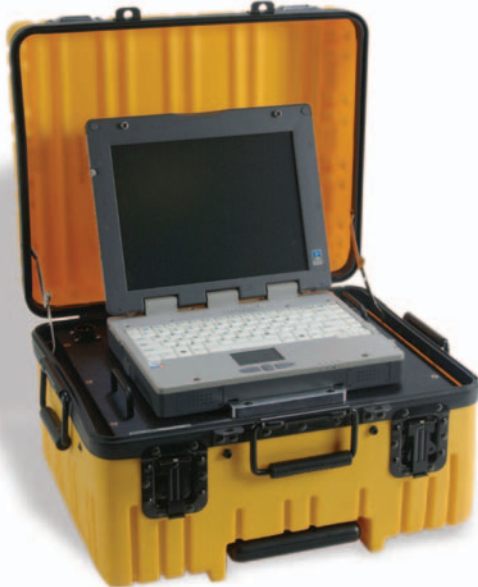
The MRX920 unit can be easily and safely installed in almost any vehicle within minutes.

Neptune's MRX920 is a rugged, portable, easy-to-use automatic meter reading device. Within minutes, the MRX920 can be securely placed in the passenger seat of any vehicle with a standard seat belt and powered via the vehicle power source.